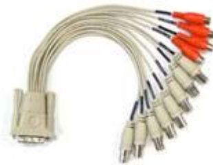
8 cam video cable