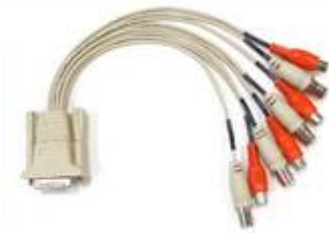
4 cam video cable